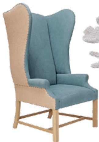
Compton linen wing chair , H133xW76xD77cm, £1,765. Oka, 0844 815 7380, okadirect.com .

TAKE IT HOME Recreate the modern, elegant style of the hotel's Ático