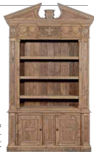
Salvage bookcase , H266xW165xD46cm, £4,900. Barker and Stonehouse, 0333 355 7900, barkerandstonehouse.co.uk .