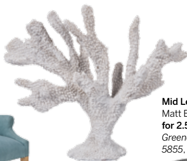
Key Largo faux coral , H30xW24xD15cm, £49. India Jane, 020 8799 7166, indiajane.co.uk .