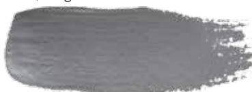
Mid Lead , Absolute Matt Emulsion, £37 for 2.5 litres. Little Greene, 0845 880 5855, littlegreene.com .