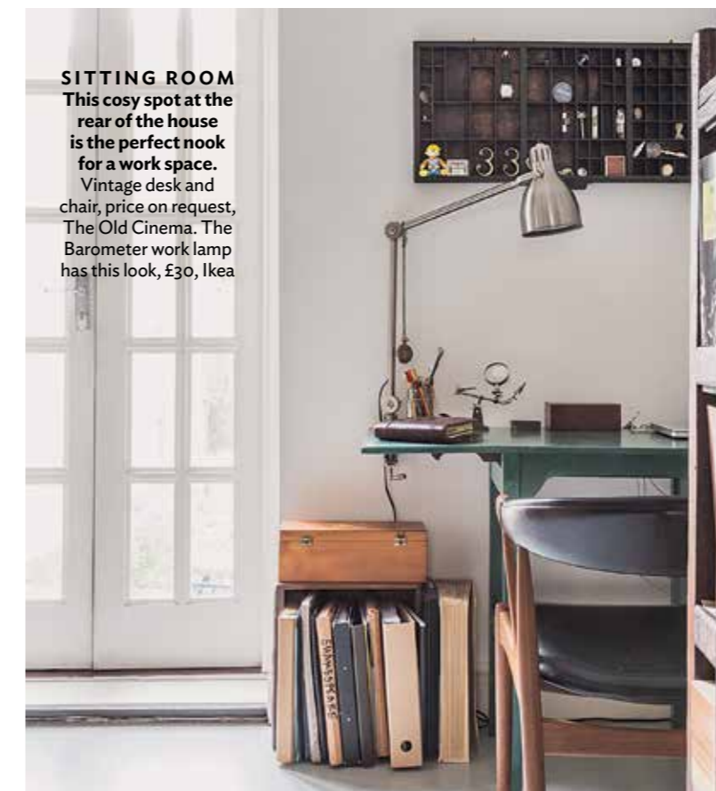
SITTING ROOM This cosy spot at the rear of the house is the perfect nook for a work space. Vintage desk and chair, price on request, The Old Cinema. The Barometer work lamp has this look, £30, Ikea