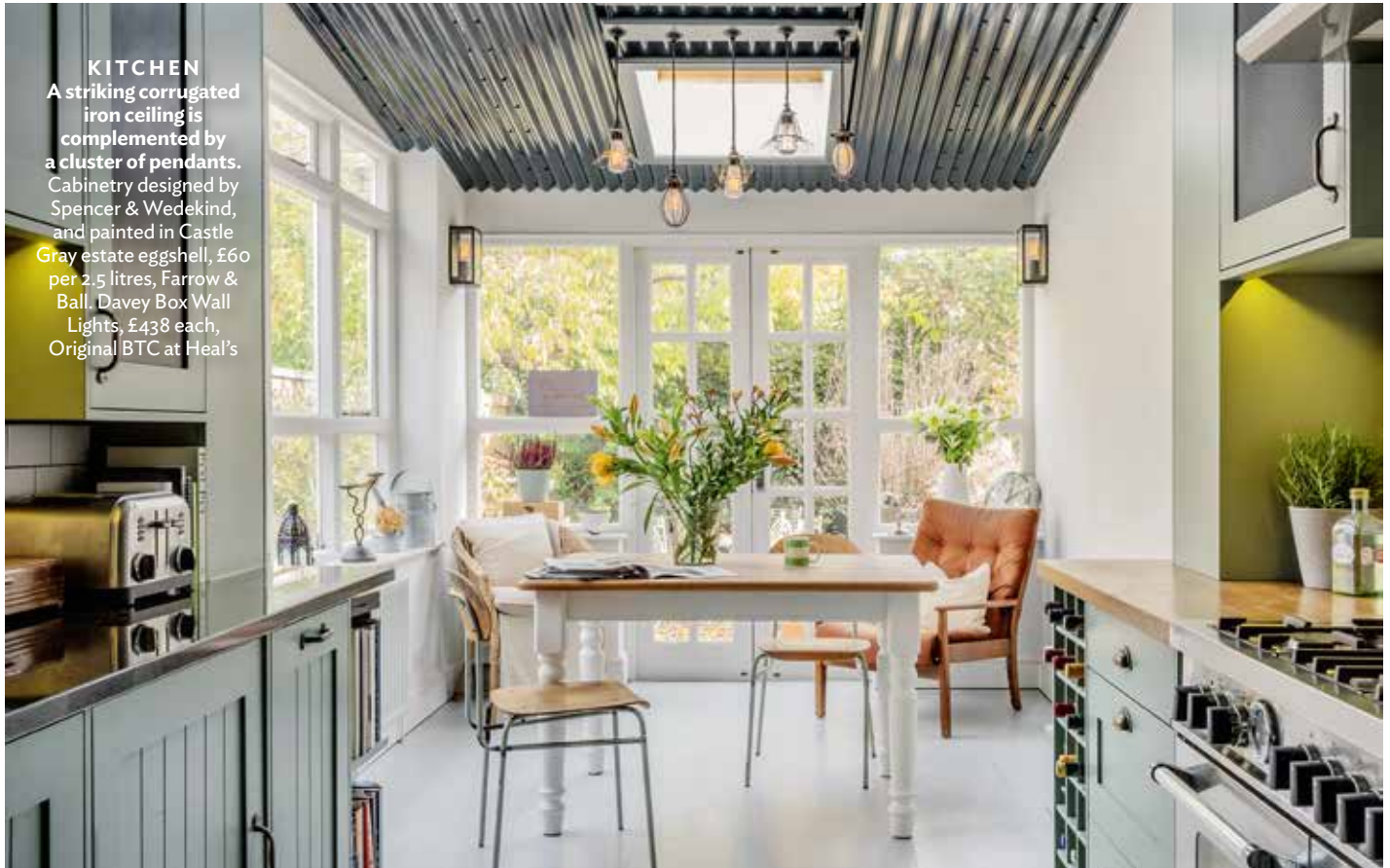
KITCHEN A striking corrugated iron ceiling is complemented by a cluster of pendants. Cabinetry designed by Spencer & Wedekind, and painted in Castle Gray estate eggshell, £60 per 2.5 litres, Farrow & Ball. Davey Box Wall Lights, £438 each, Original BTC at Heal's