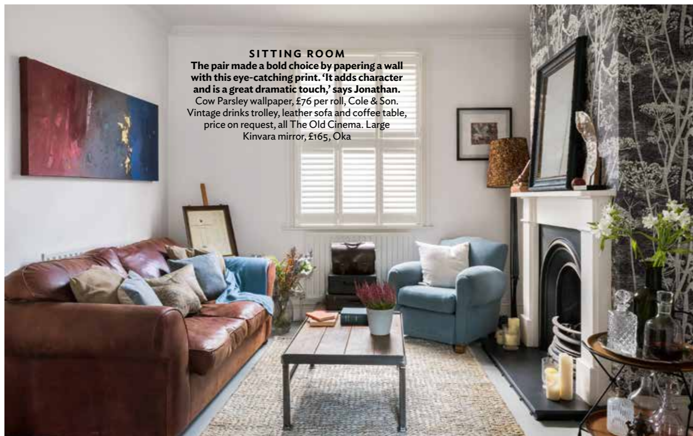
SITTING ROOM The pair made a bold choice by papering a wall with this eye-catching print. 'It adds character and is a great dramatic touch,' says Jonathan. Cow Parsley wallpaper, £76 per roll, Cole & Son. Vintage drinks trolley, leather sofa and coffee table, price on request, all The Old Cinema. Large Kinvara mirror, £165, Oka

garden makes it a great place to entertain'