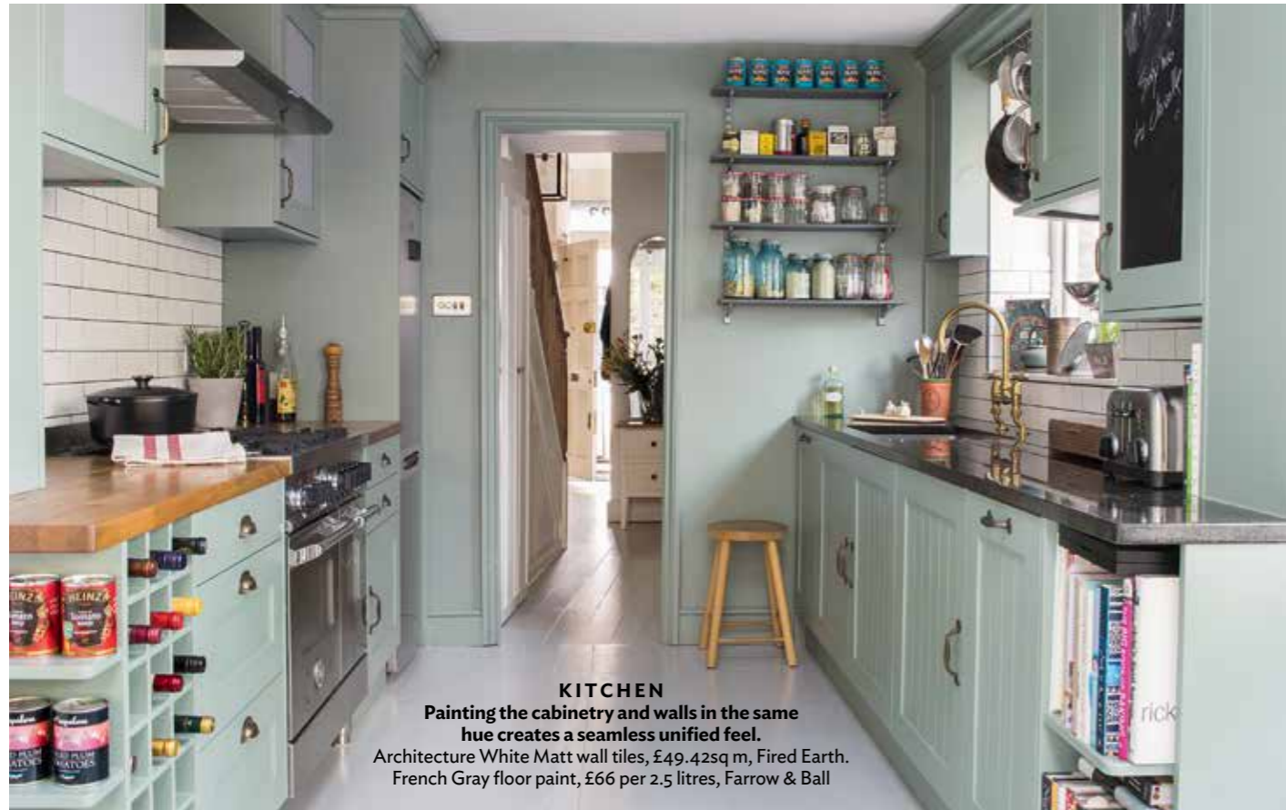
KITCHEN Painting the cabinetry and walls in the same hue creates a seamless unified feel. Architecture White Matt wall tiles, £49.42sq m, Fired Earth. French Gray floor paint, £66 per 2.5 litres, Farrow & Ball