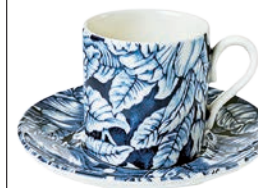
Hibiscus coffee cup and saucer, £40, Burleigh (burleigh.co.uk)