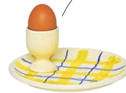
Egg-cup plate, £27, Matilda Goad (as before)