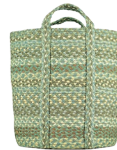
Seaspray laundry basket, £65, Braided Rug Company (braided-rug.co.uk)