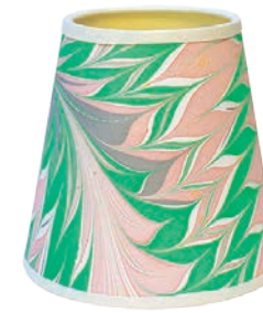
Indian paper lampshade, £83, Rosi de Ruig (rosi-de-ruig.myshopify.com)