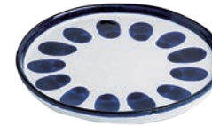
Galley Birdseye blue side plate, £10, Daylesford (daylesford.com)