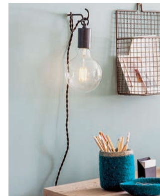
Wall light, Garden Trading