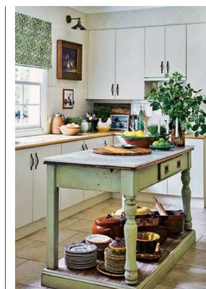
The kitchen-table island in Lisa Burdus's kitchen

As for bathrooms, 'Adding furniture, a rug, art and accessories as though it was any other room in the house makes it feel so much warmer,' she says. Shower curtains have also had a style upgrade of late, and help to soften hard surfaces - look for one in waterproof-backed cotton or linen by Linenshed (linenshed.co.uk) or Balineum (balineum.co.uk) to add instant chic.