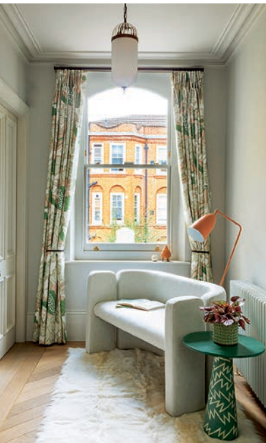
A landing used as a seating area in a project by Kitesgrove. Sofa, £850 ( sofa.com )

It's easy to let months – even years – go by without reappraising the basic furniture layout of your living space. Yet stepping back to assess the bigger picture is a game changer. Most of us favour a triangular arrangement of sofa (often with its back to the wall) and angled occasional chairs, leaving an area of dead space in the centre of the room. But changing this arrangement can provide instant uplift. 'Life isn't static and nor should homes be,' says interior designer Henrietta Holroyd ( henrietta-holroyd.com ). 'Avoid being wedded to symmetry – changing the angle of a chair or the orientation of a coffee table can make a difference to how the space feels.' Relaxing areas needn't be confined to the sitting room either – with the addition of an armchair and an angled lamp, a bedroom corner or wide landing can be turned into a cosy reading nook.