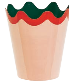
Small scallop tote planter, £36, Matilda Goad (matildagoad.com)