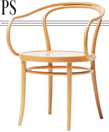
Ton armchair, from £293, Nunido (nunido.co.uk)