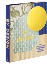
By Design: The World's Best Contemporary Interior Designers, £49.95, Phaidon (whsmith.co.uk)