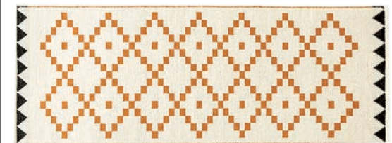
Flatweave runner, £75, Habitat (habitat.co.uk)