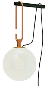
Globe plug-in wall light, £79.99, Homary (homary.com)