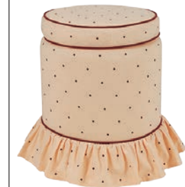
Aurora footstool, £390, Ceraudo (ceraudo.com)