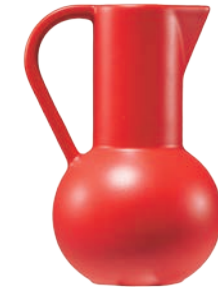
Ceramic jug, £55, Raawii (yoox.com)