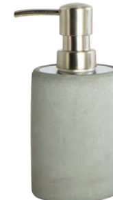
Cement soap dispenser, £30, Cox & Cox (coxandcox.co.uk)