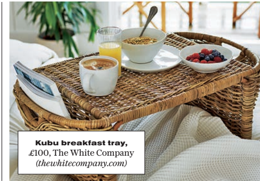
Kubu breakfast tray, £100, The White Company (thewhitecompany.com)