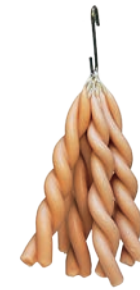
Twisted candle, £13.50 for one, Wax Atelier (waxatelier.com)