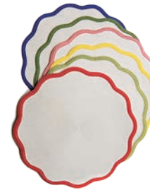
Round scalloped place mats, £28 each, Edition 94 (theedition94.com)